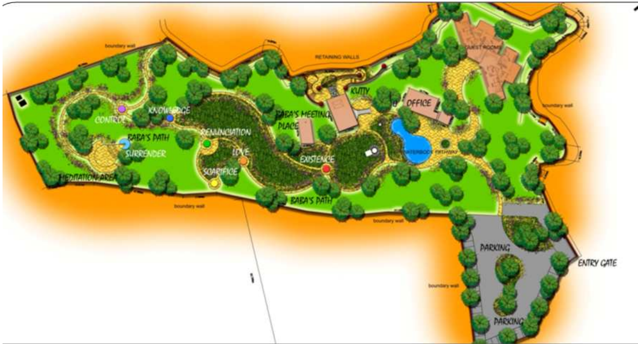
TOTAL SITE PLAN

TOTAL PROJECT COST I+II+III = 95,58,454/-